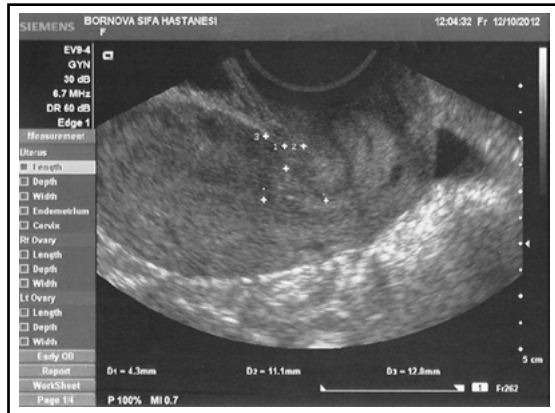
Fig.2: Ultrasound image of a uterus with locked method.