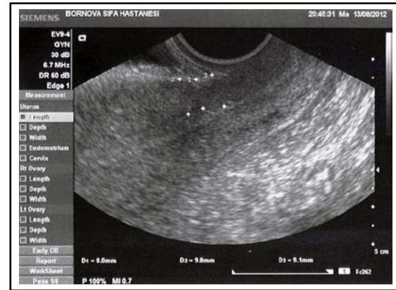
Fig.3: Ultrasound image of a uterus with unlocked method.

were performed: scar thickness (s), myometrial thickness of the isthmus uteri at the level of the internal cervica los (i), the distance between the scar and the internal cervica los 1 and the myometrial thickness of fundal neighborhood of scar with interval of scar-isthmus distance (f) (Fig. 1, 2, 3).