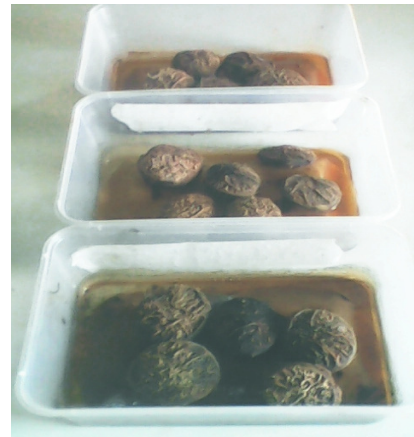
Plate 4. Detarium microcarpum in control (un treated seeds)