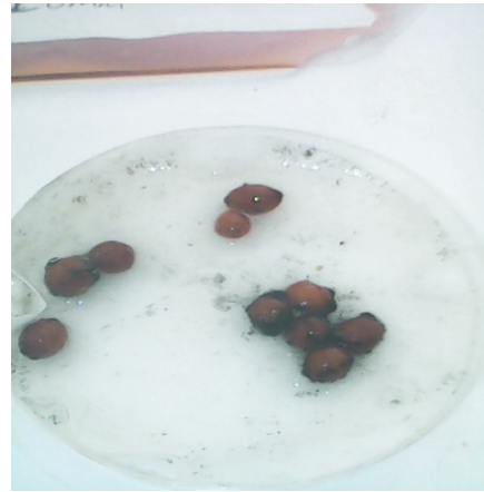
Plate 10. Ziziphus mauritiana in control

© 2019 Ambursa et al.; This is an Open Access article distributed under the terms of the Creative Commons Attribution License ( http://creativecommons.org/licenses/by/4.0 ), which permits unrestricted use, distribution, and reproduction in any medium, provided the original work is properly cited.