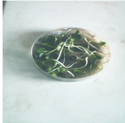
Plate 8. Ziziphus mauritiana in hot water 30 minute