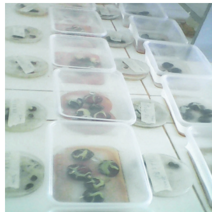
Plate 6. Experimental layout