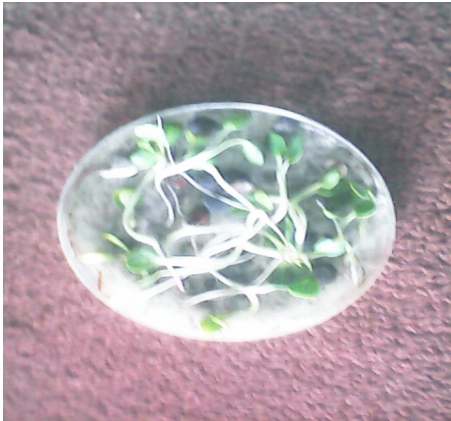
Plate 7. Ziziphus mauritiana (Scarification)