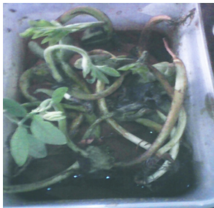
Plate 5. Detarium microcarpum seedlings