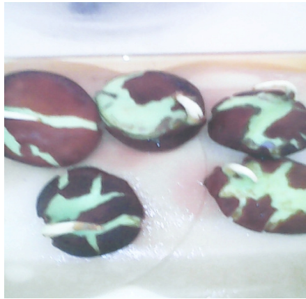
Plate 1. Detarium microcarpum Hot water 30 minute