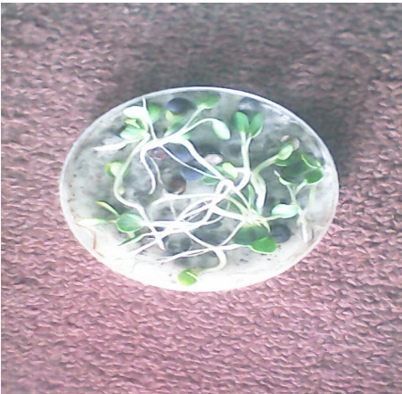
Plate 9. Ziziphus mauritiana in sulphuric acid