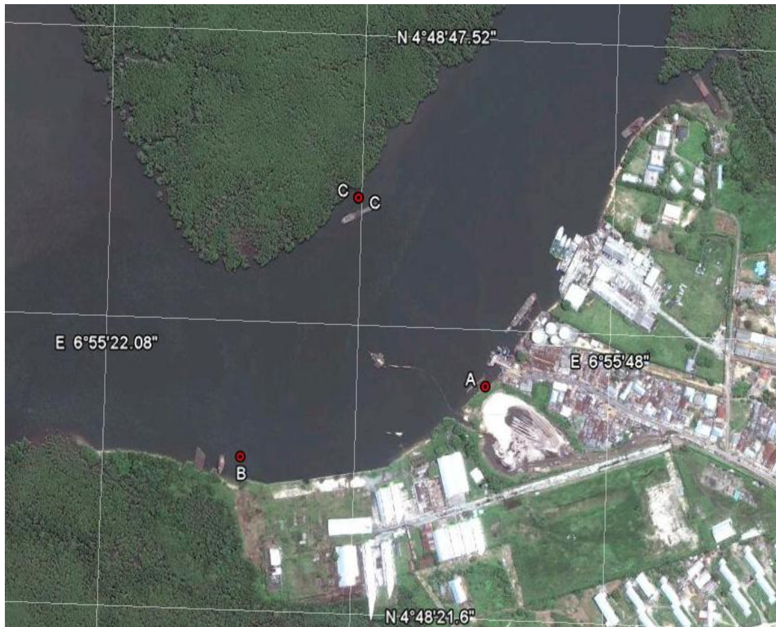
Fig. 1. Study locations plotted on Google Earth image

BART™ testers were used as designed by Cullimore, [3] to determine the types and the level of bacterial activity present in the samples. The water, sediment and rusticle samples were subjected to BART test, in order to get a semi-quantitative measurement of the number of bacteria in each type of samples. DroyconBART™ kits were used to approximate population of predicted active cells per ml (Pac/ml) which is equivalent to colony-forming units per milliliter (CFU/mL). The following BART testers HAB-BART™, IRB-BART™ and SRB-BART™ (Figs. 2-4) were used in screening the