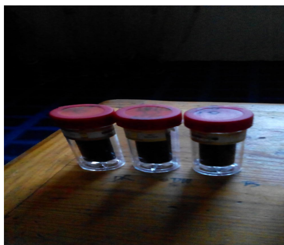
Fig. 3. IRB BARTs

activities of heterotrophic aerobic bacteria, iron related bacteria and sulphate reducing bacteria respectively as described by Cullimore, [3,18]. The Pac/ml was determined using the certificate of analysis which accompanied each box of tester.