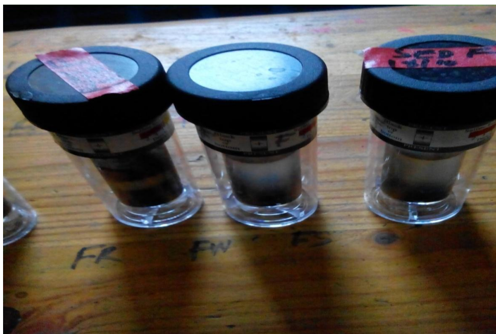
Fig. 4. SRB BARTs