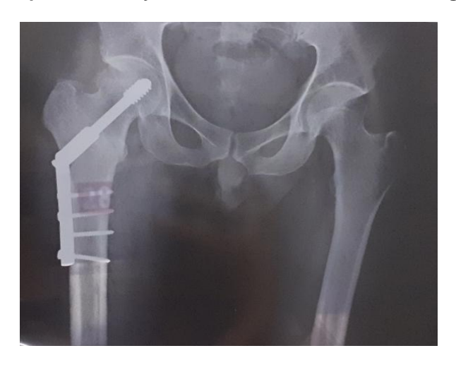
Fig. 2. Post-operative X-ray of Intertrochanteric fracture of femur with Internal Fixator as (DHS) dynamic hip screw