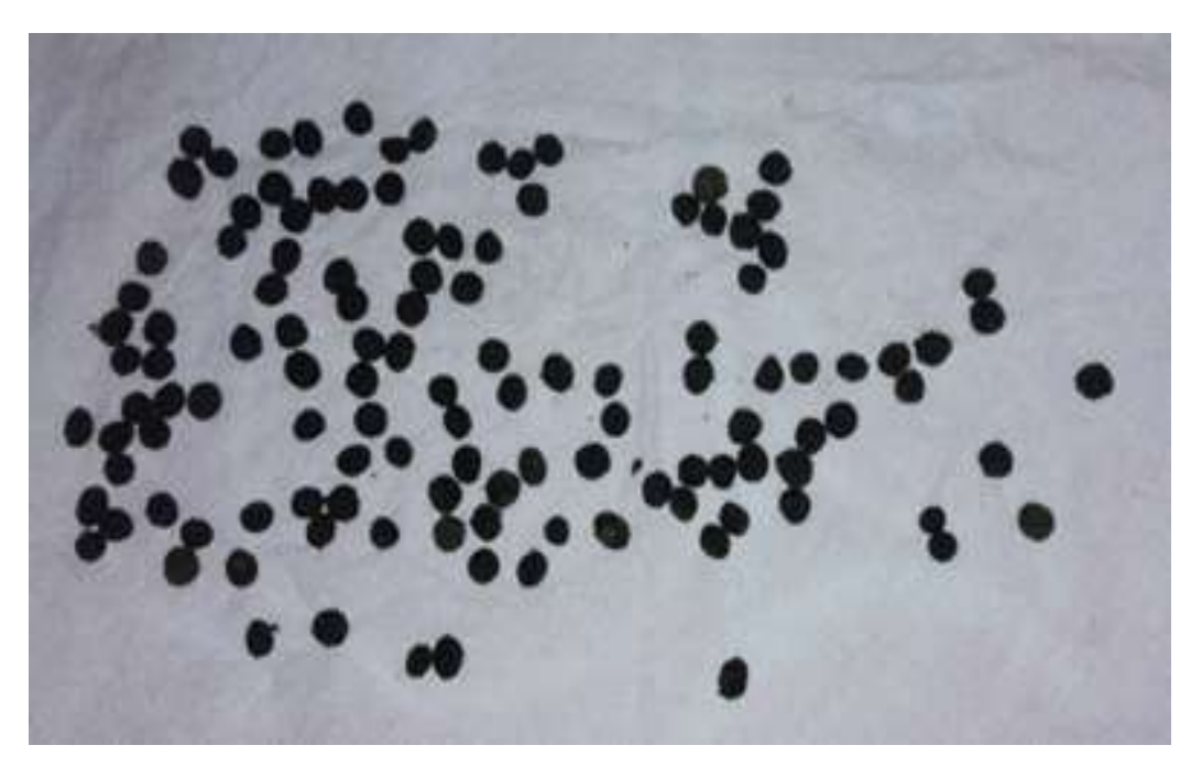
Fig. 1. The prepared smaller pills were dried in the sunlight

The experimental procedures involved in this study were conducted with careful consideration for cleanliness, ensuring that soap solution was not introduced to the process. The prepared