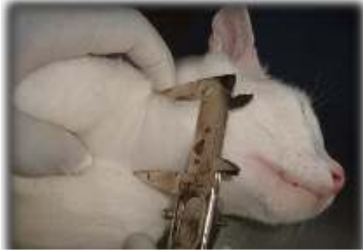
Fig. 1. Enlarged submandibular lymph nodes of the patient

core biopsy of the bone marrow was obtained. The hematology and serum biochemical panel analysis was also carried out.