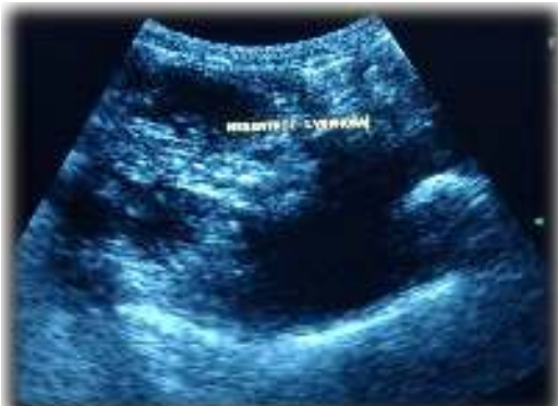
Fig. 2. Ultrasonographic assessment revealing mesenteric lymph node involvement