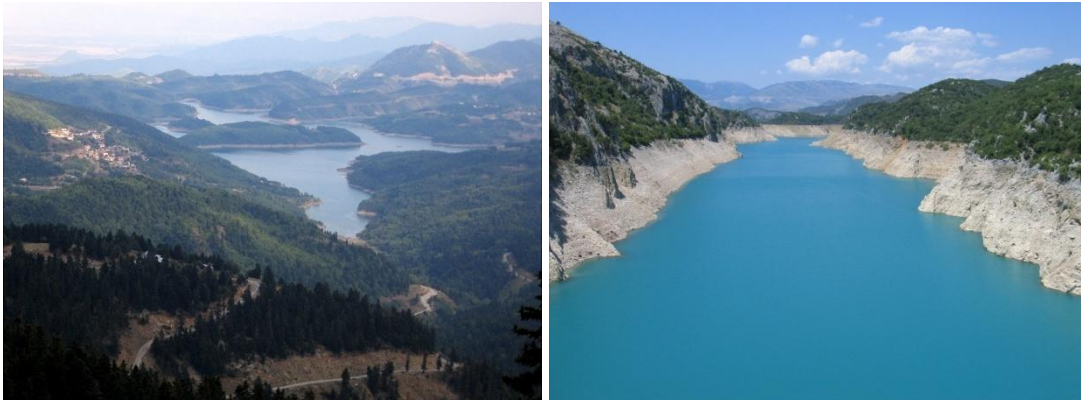
Figs. 2a & 2b. Shrinkage of the natural riparian vegetation and of the forest, caused by the creation of the dams & artificial lakes – Landscape and Land use changes. View of the artificial lake of Tavropos (Plastiras Lake), in Acheloos drainage basin (Fig. 2a). View of the artificial lake of Kremasta dam, on the Acheloos river (Fig. 2b).