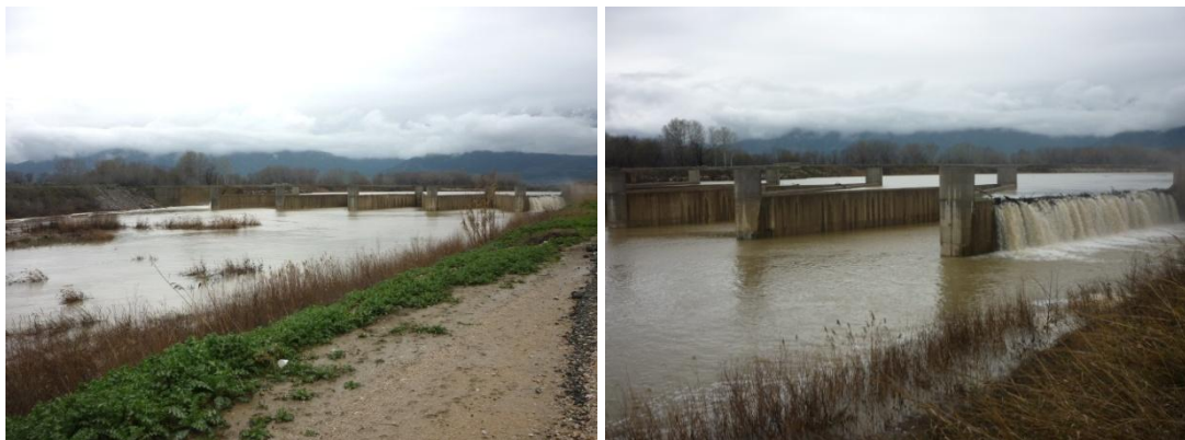
Figs. 9a & 9b. A special construction (distributor) for the artificial diversion of the Spercheios stream discharge of peak flow (flood events), in Maliakos Gulf

artificial partial diversion to the north, of the Spercheios river channel was completed in 1958 (Figs. 9a & 9b). This artificial channel is approximately 9.0 km long, 20 m wide and protected by two parallel embankments spaced 60 meters. In 2007, started the engineering works to improve Spercheios diverted river channel for the stream discharge of peak flow (flood events), in Maliakos Gulf. Constructed a special construction (distributor) for the diversion of the stream discharge, while the channel was dredged. The continuous flow of drainage in the Spercheios old riverbed (Alamana) guaranteed by the southern embankment culvert upstream of the distributor with the bottom level below the crest overflow.