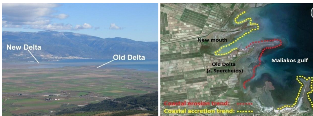
Figs. 10a & 10b. The old and new delta of Spercheios river in Maliakos Gulf (Fig. 10a). Satellite image of Spercheios estuary (Fig. 10b). The dotted lines (red) represent the medium-high vulnerability coastal zones to a potential rise of sea level. The yellow line indicates shoreline accretion trend

transfer of sediments by the Spercheios river and their deposition into the Delta and coastal areas.