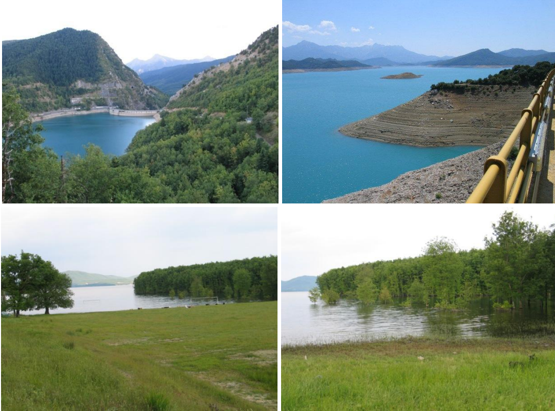
Figs. 4a, 4b, 4c & 4d. The arch-gravity dam of Tavropos (Plastiras Lake), in Tavropos river (Acheloos drainage basin) (Fig. 4a). Shrinkage of the natural riparian vegetation and of the forest, caused by the creation of the Kremasta dams in Acheloos river (Fig. 4b). Decrease of the natural riparian vegetation and of the forest, by flooding caused by the operation of the Plastiras artificial Lake (Fig. 4c & 4d)

Other anthropogenic interventions have changed the river network shape, the valley floor morphology and the Delta of the river Acheloos, such as the intensification and development of agriculture, construction of irrigation channels and drainage pits, uncontrolled watering from surface water tables, uncontrolled pumping of underground waters, urbanization of large coastal zones without regarding the natural environment, etc. [14,15,62].