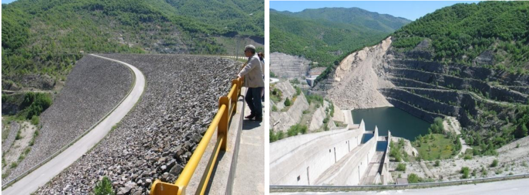
Figs. 3a & 3b. Thissavros earth dam with central clay core, in Nestos river (Fig. 3a). Changes in landscape, landforms, geology and vegetation in the area downstream of the Thissavros dam, caused by the dam construction works (Fig. 3b)

(Akroneri), and these sediments are moved west-northwest along with the waves and the coastal currents [32].