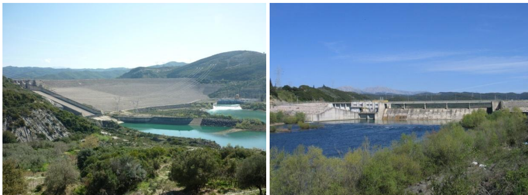
Figs. 6a & 6b. Pournari I earth dam with central clay core, in Arachthos river (Fig. 6a). The small dam Pournari II, regulates the flow of river water Arachthos (Fig. 6b)

The placement of the dam “Pournari I”, in the main riverbed of Arachthos, in a short distance from the area of the estuaries of Arachthos river to the gulf of Amvrakikos, were the cause of interruption the transportation and deposition of some volume of sediments from the drainage basin to the downstream of the dams “Pournari I & II and in the Delta. Around 2.900.000 m 3 /year, sediment deposited in the reservoir “Pournari I” and thus low alluvial plain of Arta, the Delta and the Amvrakikos gulf devoid of significant amounts of sediments and limited to 700.000 m 3 /year, resulting in reducing of the rate of advance of the coastline at the Delta and at the coastal zone and in locations show retreat tendency [67] (Fig. 8b).