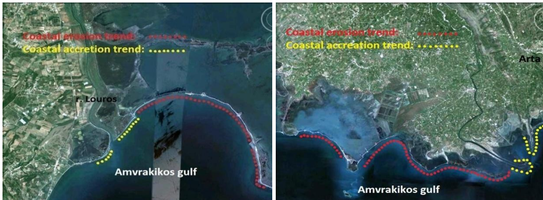
Figs. 8a & 8b. Satellite images of Louros (Fig. 8a) and Arachthos estuaries (Fig. 8b). The dotted lines (red) represent the medium-high vulnerability coastal zones to a potential rise of sea level. The yellow line indicates shoreline accretion trend. Are distinguished the complex of lagoons (Logarou, Tsoukalio, Rodia) and the thin sand barriers

Also have appeared alterations in geomorphological processes (disruption of the morphology of Louros river watershed, etc.), which are caused by Louros hydroelectric dam which result to changes at erosion phenomena of the river basin and at the transport-deposition of sediments. Changes in the delta and the coastline are negligible because of the limestone composition of geological substrate in the Louros watershed and low particulate matter/sediments production. Despite the construction of the Louros dam; in 1954; in the Louros river; up-dam area: 43%; the sediment load of the river has not changed significantly, due to its initially low sediment load [30,31] (Fig. 8a).