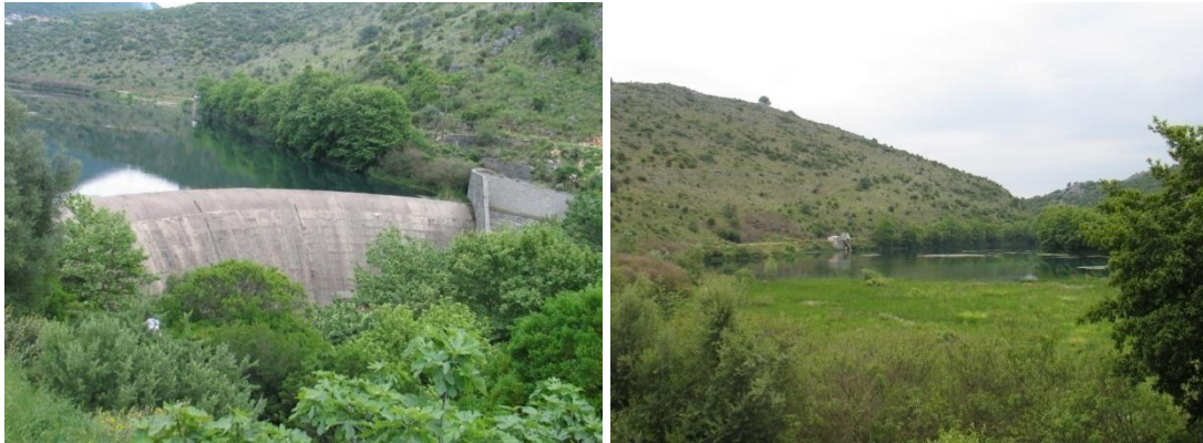
Figs. 7a & 7b. Louros arch-gravity dam, in Louros river (Fig. 7a). Partial filling of the Louros artificial lake with sediments (Fig. 7b)

Also have appeared alterations in geomorphological processes (disruption of the morphology of Louros river watershed, etc.), which are caused by Louros hydroelectric dam which result to changes at erosion phenomena of the river basin and at the transport-deposition of sediments. Changes in the delta and the coastline are negligible because of the limestone composition of geological substrate in the Louros watershed and low particulate matter/sediments production. Despite the construction of the Louros dam; in 1954; in the Louros river; up-dam area: 43%; the sediment load of the river has not changed significantly, due to its initially low sediment load [30,31] (Fig. 8a).