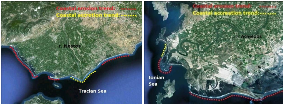
Figs. 5a & 5b. Satellite images of Nestos (Fig. 5a) and Acheloos deltas (Fig. 5b). The dotted lines (red) represent the medium-high vulnerability coastal zones to a potential rise of sea level. The yellow line indicates shoreline accretion trend

geomorphologic and land use changes concerning the coastal plains and the coastal area are also detected. The degradation of this coastal area is accelerated by the salt water's intrusion, the over-exploitation of the groundwater and the expansion of the touristic structures.