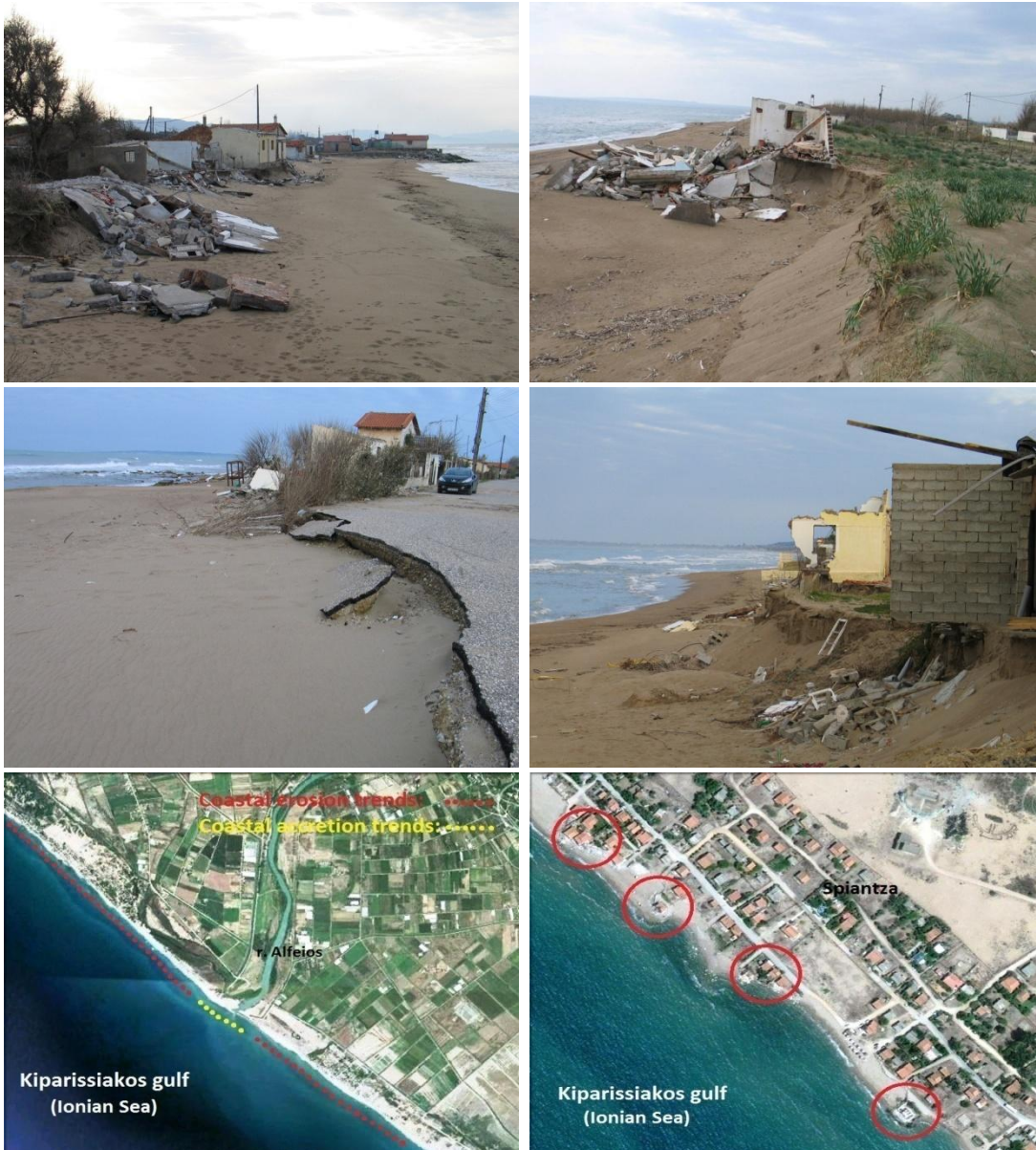
Figs. 12a, 12b, 12c, 12d, 12e & 12f. Certain damages caused by coastline erosion in Epitalion and Spiantza, near at the mouth of Alfeios river (Pyrgos) (Fig. 12a, 12b, 12c & 12d). Satellite image of Alfeios estuary and Spiantza coastal area (Fig. 12d & 12f). The dotted lines (red) represent the medium-high vulnerability coastal zones to a potential rise of sea level. The yellow line indicates shoreline accretion trend (Fig. 12e). Into the circle the destroyed houses by coastline erosion in Spiantza (Fig. 12f)

Besides the morphological impacts to the river network shape there are also serious economic damages caused by human activity. During the winter of 1999, the Flokas dam bridge was closed for a long period due to damages at its foundation caused by the heavy