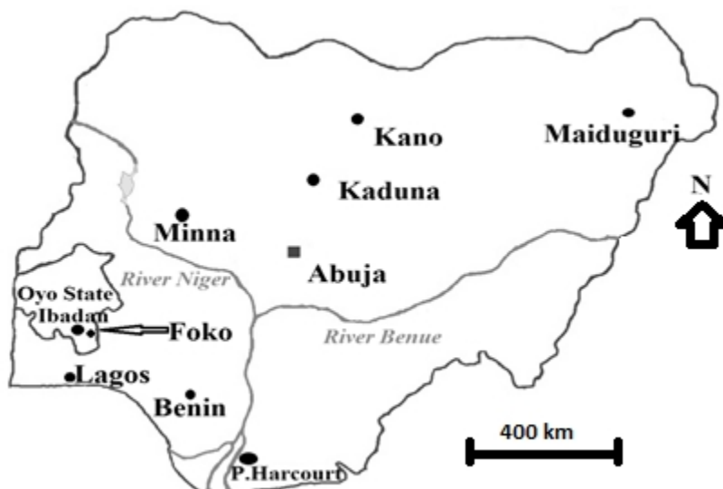
Fig. 1. Map of Oyo State in Nigeria showing the study area (arrowed)