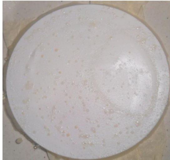
Plate 1. Total heterotrophic bacteria growth on the membrane filter

contaminated [9]. Ground water is found to be contaminated due to improper construction, shallowness, and various human activities around the well [10]. In this study, the total heterotrophic counts for some of the samples were quite high compared to E.P.A and W.H.O standards of 1.0 \times 10^2 for total heterotrophic bacteria while total coliform count was also quite high in comparison with W.H.O and E.P.A standards of zero per 100 ml for total coliforms.