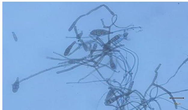
Figure-1. Microscopic view of Alternaria porri causing purple blotch of onion.

curve along with light to deep brown colour which confirms the existence of A. porri . The number of horizontal and vertical separation in the conidia ranged from 3.00 to 6 μmm as shown in fig.