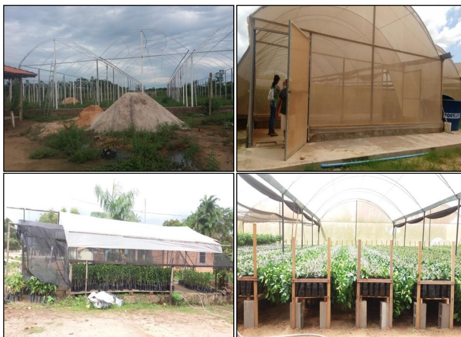
Fig. 1. Protected cultivation system of the community of Santa Luzia do Induá, Captain Poço/PA