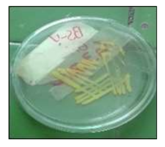
Figure 1. Pure culture of Micrococcus sp.

The degrading activity of isolate was obtained by using mineral salt media (MSM) (Khan and Rizvi, 2011) in which 1% hydrocarbon (petrol and paraffin wax liquid) was added. Two plates of MSM agar were prepared and labeled as 1 and 2; 1% petrol and paraffin wax was added as a sole carbon sources, respectively. Media was