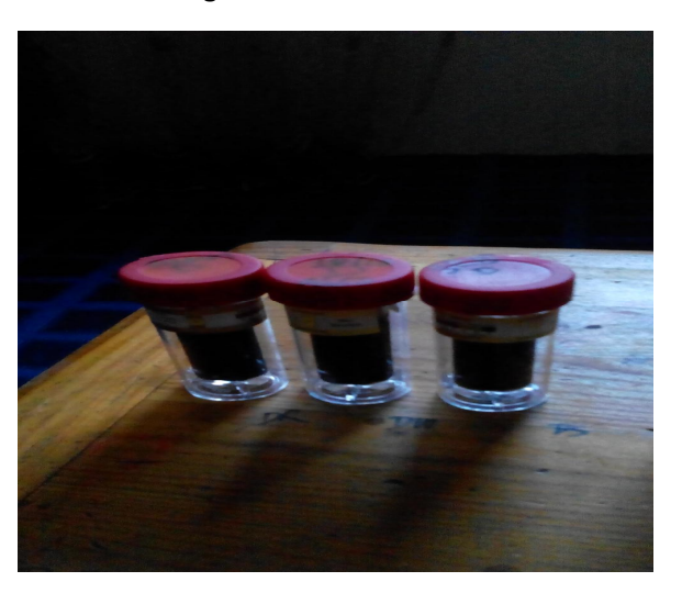
Fig. 3. IRB BARTs

activities of heterotrophic aerobic bacteria, iron related bacteria and sulphate reducing bacteria respectively as described by Cullimore, [3,18]. The Pac/ml was determined using the certificate of analysis which accompanied each box of tester.