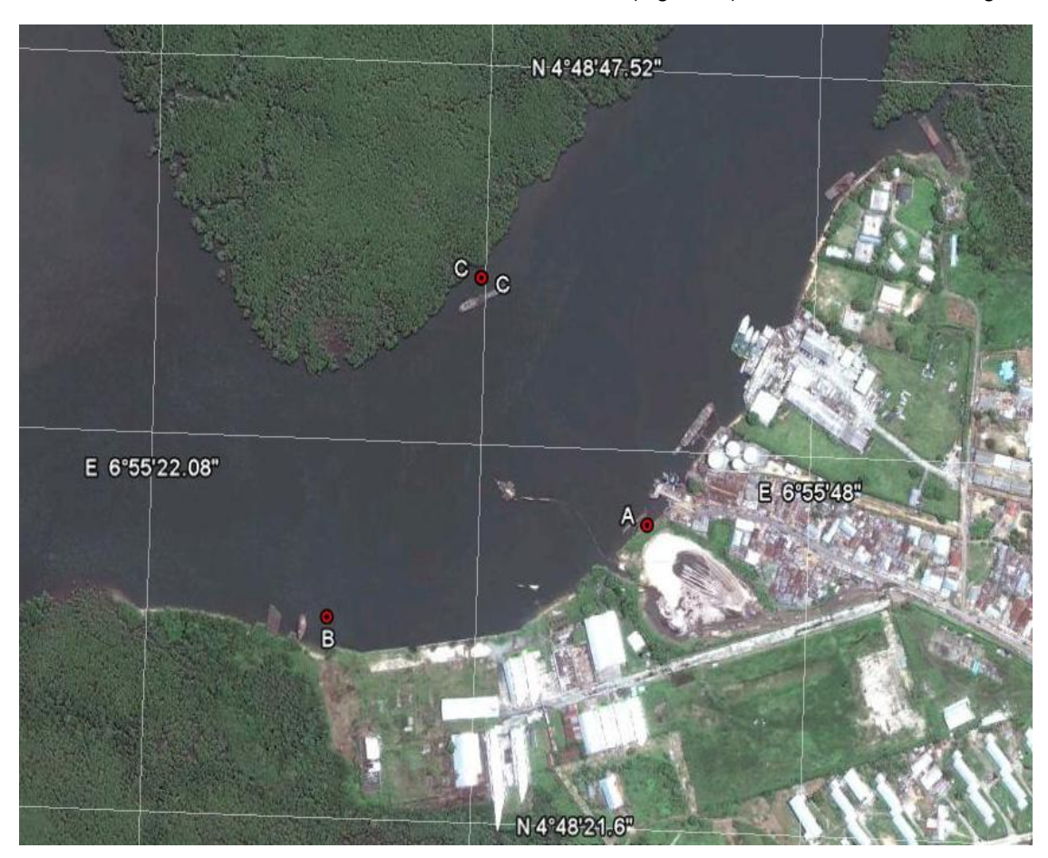
Fig. 1. Study locations plotted on Google Earth image

BART<sup>TM</sup> testers were used as designed by Cullimore, [3] to determine the types and the level of bacterial activity present in the samples. The water, sediment and rusticle samples were subjected to BART test, in order to get a semi-quantitative measurement of the number of bacteria in each type of samples. DroyconBART<sup>TM</sup> kits were used to approximate population of predicted active cells per ml (Pac/ml) which is equivalent to colony-forming units per milliliter (CFU/mL). The following BART testers HAB-BART<sup>TM</sup>, IRB-BART<sup>TM</sup> and SRB-BART<sup>TM</sup> (Figs. 2-4) were used in screening the