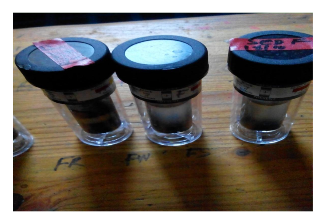
Fig. 4. SRB BARTs