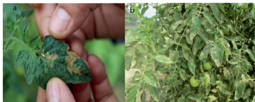
Fig. 2. Infestation of tomato leaf caused by (a) Tuta absoluta ; (b) Liriomyza spp. [34,47]