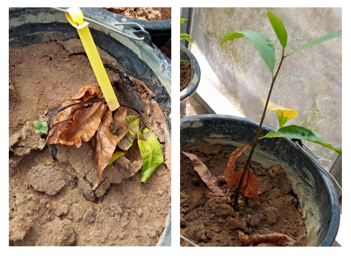
Fig. 1. Cashew seedlings showing brown water soaked stem, wilting of stem and defoliation

Colletotrichum cashew plant [27]. gloeosporioides was reported to cause severe leaf and shoot blight on cashew seedlings in the nursery with symptoms similar to those on adult cashew plants [11]. Root rot caused by Pythium is another common pathogen of cashew seedlings, which causes yellowish colouration of leaves, followed by wilt and death. Other oomycetes such as Phytophthora heveae and P. nicotiana have also been observed to cause blight in cashew seedlings during rainy season, which can be devastating if not controlled in few days [11]. Mostly, report has shown that cashew seedling blight is caused by a number of fungi including Fusarium spp, Pythium spp. Phytophthora palmivora, Cylindrocladium scoparium, Selerotium rolfsii and Pythium ultimum; most of which occurs mainly in the nursery [24]. However, report has also shown that some of these fungi can be endophytic to cashew plants [28], Thus causing diseases when conditions are favourable. Usually, all the fungi isolated can threaten cashew seedling health if measures are not put in place to check them.