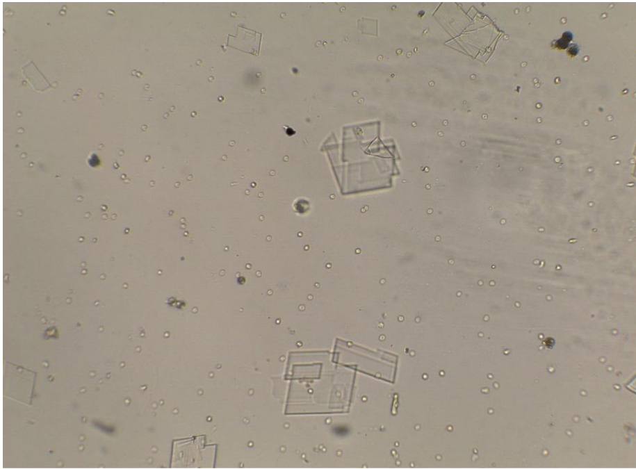
Fig. 2. wet mount, 10x40X showing transparent pale refractile octahedral crystals