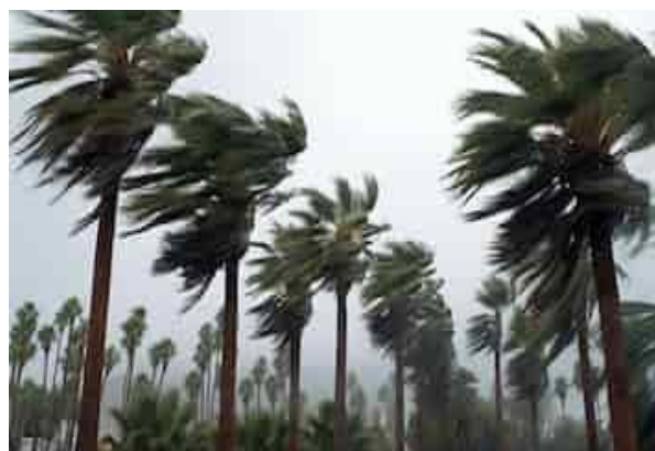
Fig. 10. Resiliency of Borassus flabellifer to extremely severe cyclone