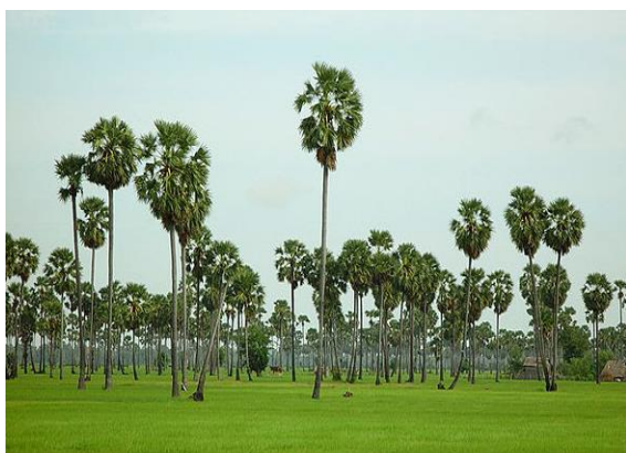
Fig. 9. Borassus flabellifer on paddy field

Current agricultural policies frequently favour conventional models, such as monoculture systems, often providing incentives that overlook agroforestry practices. Support mechanisms like price controls and favorable credit terms typically do not extend to tree cultivation, making it harder for farmers to adopt agroforestry. Economic incentives in terms of bank loan at low rate of interest, deduction of income tax for tree farming, subsidies, supply of tree seedlings, free technical support and financial support to agroforestry entrepreneurs may be given for enhancing agroforestry adoption.