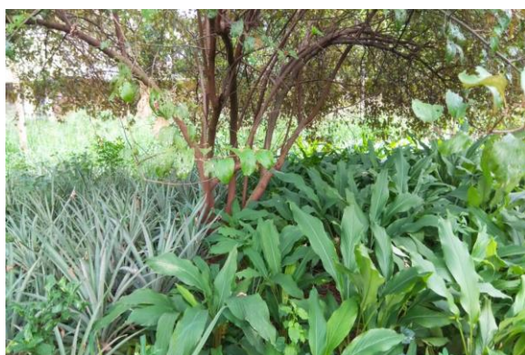
Fig. 7. Pineapple and Turmeric crops under Ziziphus mauritiana