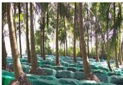
Fig. 3. Paddy straw mushroom cultivation under coconut trees

Rural communities often face extreme poverty and marginalization, with limited opportunities for a decent livelihood driving migration to urban areas. Women, who typically have less access to resources than men, are particularly vulnerable to land degradation and natural disasters, especially in women-headed households. They are often tasked with gathering firewood, a time-consuming activity. Indigenous peoples, who comprise 5% of the global population but account for 15% of the world's poor, also face unique challenges.