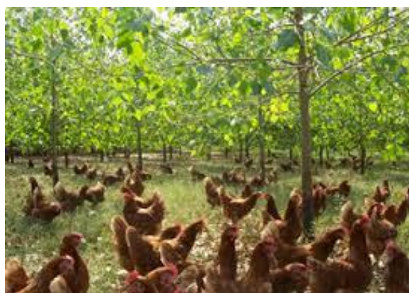
Fig. 2. Poultry farming under Poplar plantation

Integrating trees into agricultural landscapes can reduce the impacts of climate change on farming while also minimizing agriculture's contribution to the problem. This can be achieved through several mechanisms: