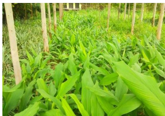
Fig. 8. Pineapple and Turmeric crops under Eucalyptus europphylla