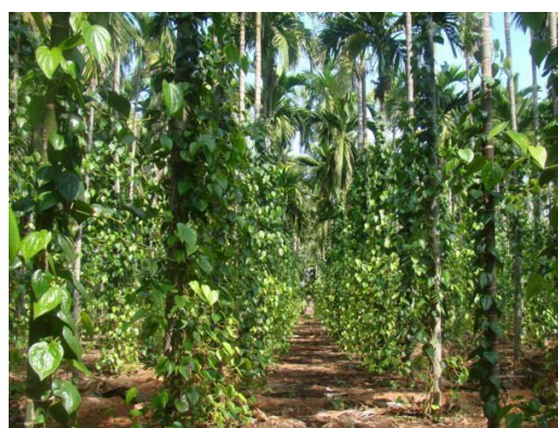
Fig. 6. Betel vine cultivation on arecanut trees