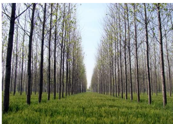
Fig. 1. Wheat cropping under Poplar plantation