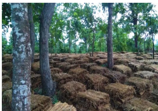
Fig. 4. Paddy straw mushroom cultivation under sal trees