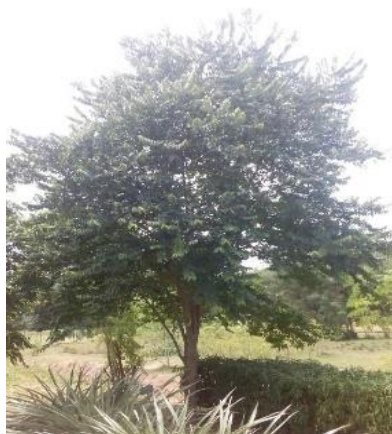
Fig. 1. Celtis timorensis plant