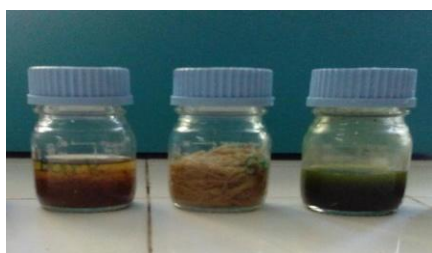
Fig. 3. Maceration of Bark, stem and root extracts of C. timorensis

20g of each part of C. timorensis was ground into a fine powder and added to 100 ml of solvent. The prepared samples were filtered, and the filtrate was considered the stock crude solution. The extracts were dissolved in distilled water and a dilution series was prepared (200 mg/ml, 150 mg/ml, 100 mg/ml, and 50 mg/ml).