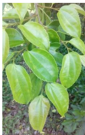
Fig. 2. Celtis timorensis leaves