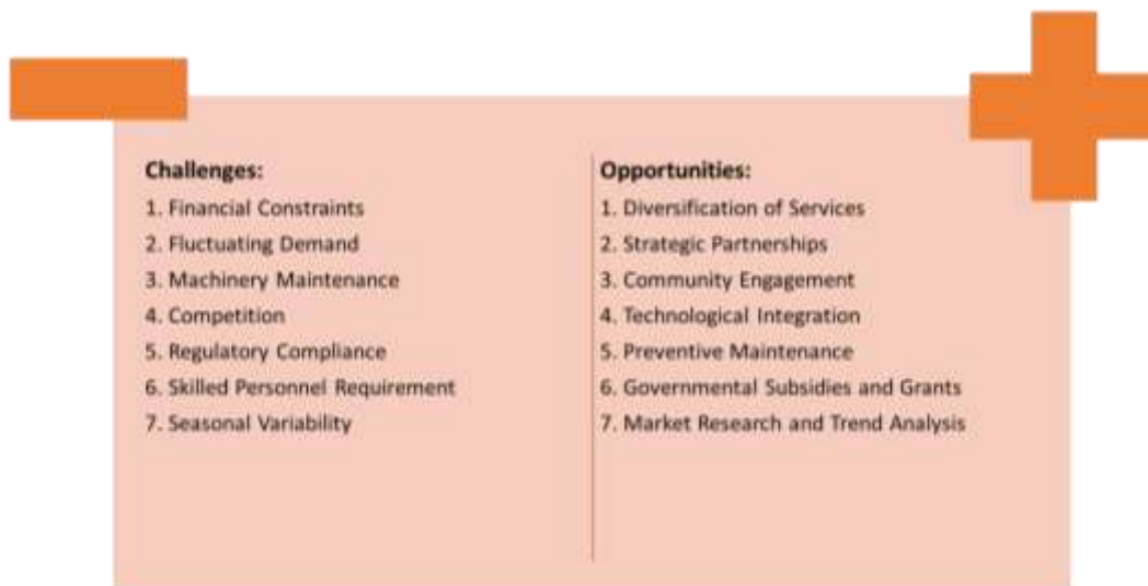
Fig. 3. Challenges and Opportunities of CHCs

CHCs have heralded a paradigm shift for small and marginal farmers, enabling subsidized access to costly farm machinery on a rental basis, and consequently, facilitating timely agricultural operations. A specific study conducted in the Coimbatore district of Tamil Nadu honed in on this aspect, encompassing 90 farmers from regions where Custom Hiring Service Centers were operating efficiently, and revealed a high level of satisfaction among farmers due to the accessibility of farm machinery at CHCs. However, a primary bottleneck identified was the scarcity of skilled labor for farm operations [12].