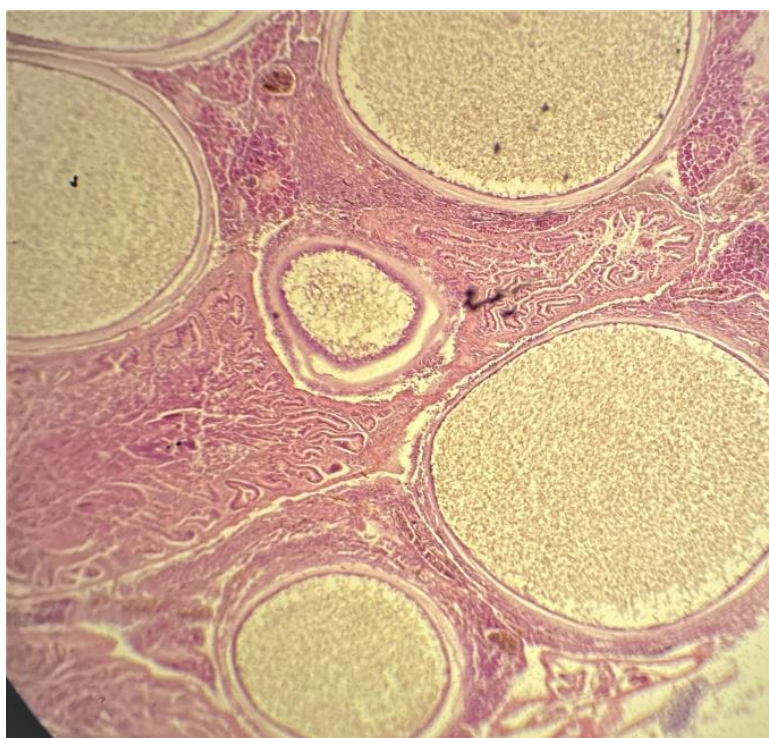
Fig. 4. Histological section of fatty tumor on the guts of Alosa fallax fish infected with the parasite Glugea sp