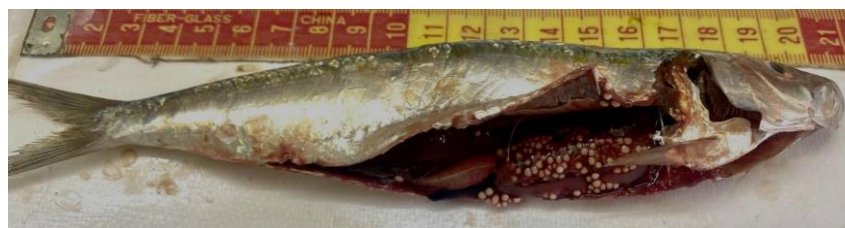
Fig. 1. Alosa fallax caught from Ras al-Bassit on 24/7/2023, with a total length of 21 cm and a weight of 59.83 gr

Alosa fallax was collected from the Syrian marine waters using Purse nets during the period from 10/19/2021 to 7/24/2023, and its total number reached 1,100 individuals. On 7/24/2023, one of the individuals was found infected with a parasitic disease (Fig. 1), as it was found during the anatomy of the sample. The presence of fatty