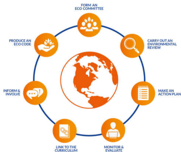
Fig. 2. An infographic of the Seven Steps Framework and the Eco-Schools Themes [8]