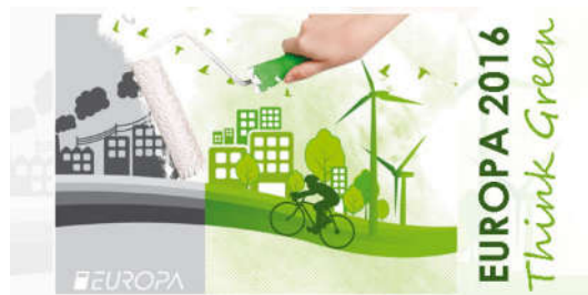
Fig. 3. Representation of the human community's belonging to the environment through dedicated philatelic issues [10]

As Sergidou describes her philatelic design [11], the main purpose was to show that it is in the community's hand to create a greener planet, and actively replacing the grey colour - the environmental pollution - with the green colour which symbolizes environmental living and hope, and in turn inspire us for a better world. The promotion of the concept of green thinking, environmental education appears both at the level of postage stamps [11,12], and envelopes with the mention "first day of the issue" [13,14], or other philatelic materials.