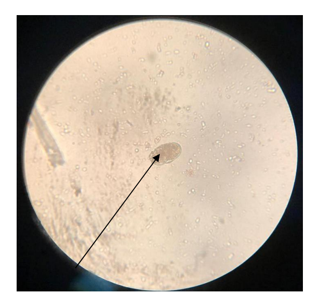
Plate 2. Ova of hookworm

Ishaku et al.; ARRB, 35(2): 96-106, 2020; Article no.ARRB.56018