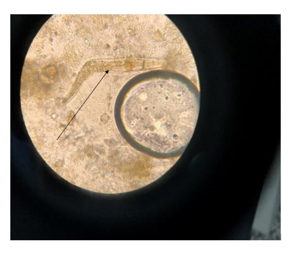
Plate 3. Larva of Strongyloides stercoralis