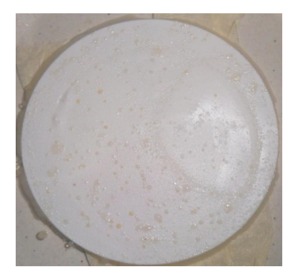
Plate 1. Total heterotrophic bacteria growth on the membrane filter

contaminated [9]. Ground water is found to be contaminated due to improper construction, shallowness, and various human activities around the well [10]. In this study, the total heterotrophic counts for some of the samples were quite high compared to E.P.A and W.H.O standards of 1.0 \times 10^2 for total heterotrophic bacteria while total coliform count was also quite high in comparison with W.H.O and E.P.A standards of zero per 100 ml for total coliforms.