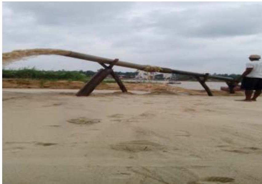
Fig. 7. Sand mining at Otuogiri

Also, more structures are springing up with markets, shops, restaurants and night clubs and other economic activities all receiving a boost. A boat transport operator hinted that his business has been made easy and more viable because of the dredging activities. However, fishermen can