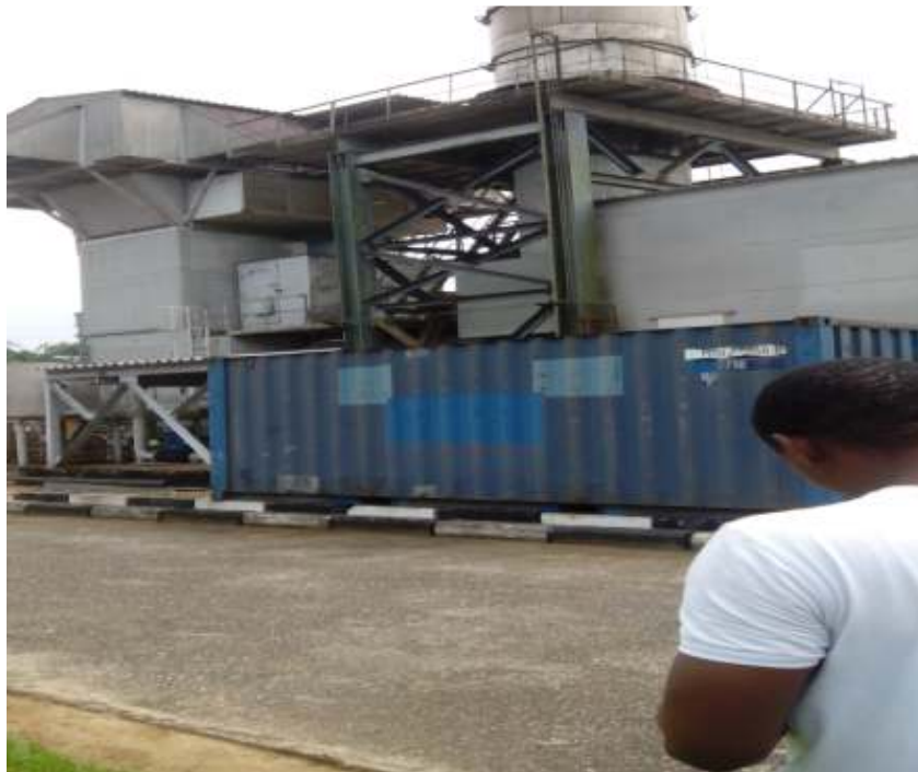
Fig. 6. The first gas turbine

Gas flaring is generally discouraged as it releases toxic components into the atmosphere and contributes to global warming. In Western Europe, 99 per cent of the associated gas is