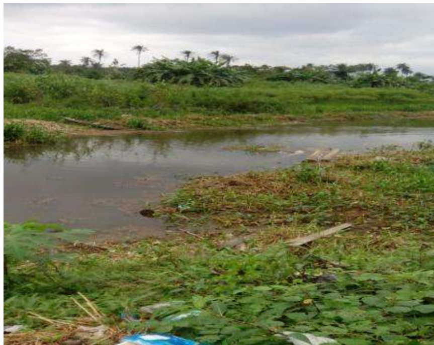
Fig. 4. Oil pollution of Kolo creek

It is pertinent to mention here that the major raw material for the gas turbine power station is gas, which is in abundance in the Niger Delta region. Nigeria flares more natural gas associated with oil extraction than any other country. With an estimated 3.5 billion cubic feet of associated gas produced annually, 2.5 billion cubic feet (about 70 per cent) is flared. Flaring is done by the oil companies because it is costly to separate commercially viable associated gas from the oil. Oil companies operating in Nigeria also harvest natural gas for commercial purposes, but prefer to extract it from deposits where it is found in isolation as non-associated gas. Thus, associated gas is burned off in order to reduce cost.