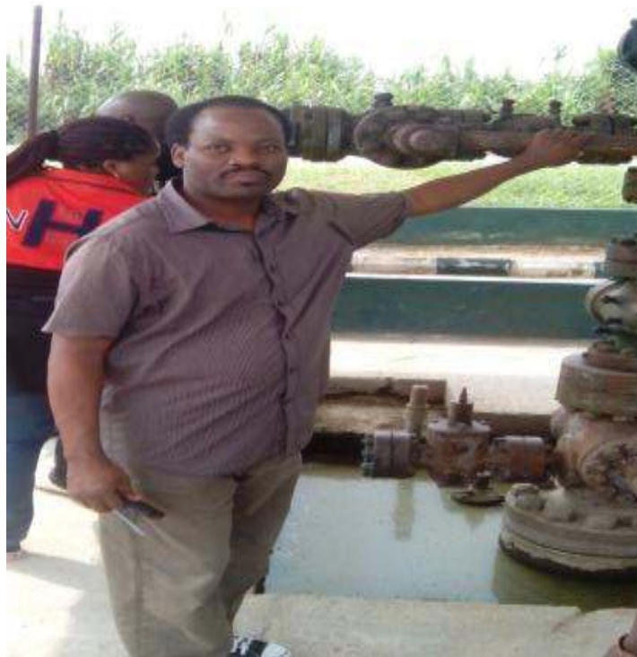
Fig. 2. Oloibiri oil well

Findings obtained through PRA showed that Oil was first discovered in Nigeria in commercial quantity by SHELDIAC Company on 15 th January, 1956 at a village called "Otuabagi" in Ogbia Local Government Area of Bayelsa State. The Oil Well was named Oloibiri because Oloibiri was the district headquarters of Ogbia Council in 1956 where the multinational oil company was located. A community leader at Otuabagi attributed the misconception in the naming of the first oil well after Oloibiri instead of Otuabagi as a deliberate attempt to create confusion in the area.