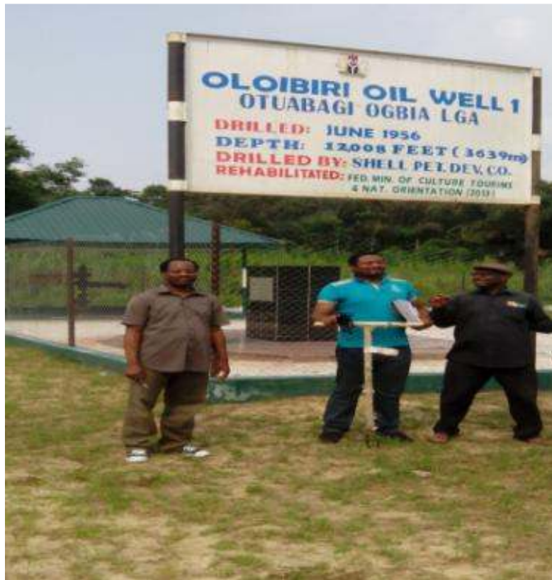
Fig. 3. Renovated Oloibiri oil well

The discovery of oil in 1956 ended the 50 years of misery and launches Nigeria into the field of petrol state. The depth of the oil well was 12,008 feet (3,639 metre). It was tested and discharged about 5,000 barrel per day. Oloibiri oil field comprises of 22 Oil Wells, whereas Oloibiri as a community does not have any boundary with any of the oil wells. Rather, Otuabagi community owned 18 out of the 22 Oil Wells. Another community leader stated during the group discussion that SHELL exploration activities have brought an untold hardship to the community. In term of corporate social responsibility (CSR), not much has been done to the community. The first appeal to the oil company was in 1991 with the construction of secondary schools and the granting of scholarship by Shell to some selected members of the community. It is of note that the only major road at Otuabagi is the one that leads to the first oil well which according to a respondent was constructed by shell not for the community but because of access to the oil well by the multinational company.