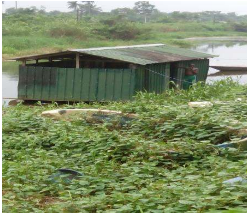
Fig. 5. Feecal pollution on Kolo creek